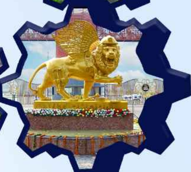
VIT - AP